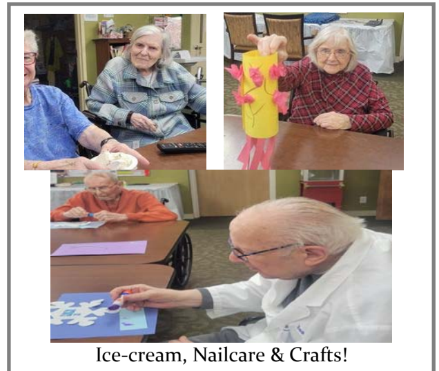
Ice-cream, Nailcare & Crafts!